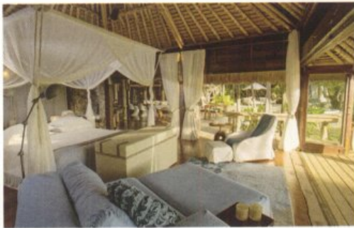
Words: Matt Pomroy

The villas are self-contained with large master bedrooms, en-suite bathrooms